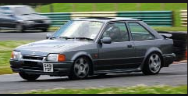
Decent tyres will transform your car when on track days

In between wets and slicks. They are normally a slightly softer compound than slick tyres and are cut with shallow grooves. These grooves