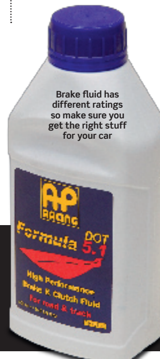
Brake fluid has different ratings so make sure you get the right stuff for your car

Moisture in the air makes its way into your