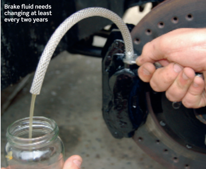
Brake fluid needs changing at least every two years

Braking systems via the caliper piston seals, the microscopic pores in the rubber brake hoses, the nylon master cylinder reservoir and various other rubber seals in the hydraulic system. Sadly, there is nothing we can do about that and if we left this moisture where it landed the water would rot our braking system from the inside out, causing many accidents and fatalities. Now, because our brake fluid is designed to absorb the water chemically, the concentration levels of absorbed water are kept to an absolute minimum and as a result the water is simply collected and contained within the fluid pending your two yearly changes. Another benefit