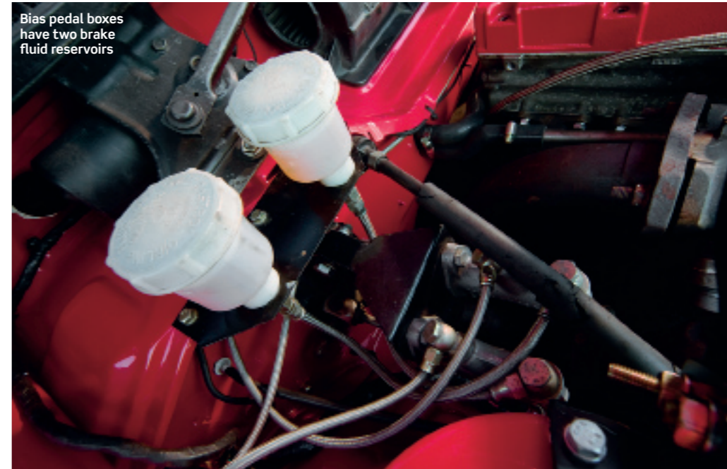
Bias pedal boxes have two brake fluid reservoirs

It's the same feeling as having air in your brakes, because that's