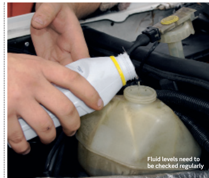
Fluid levels need to be checked regularly

Hopefully you've read my last two articles on fluids; the first on water cooling and how it works and last month's about lubricating oils, how they work and how to keep them cool.